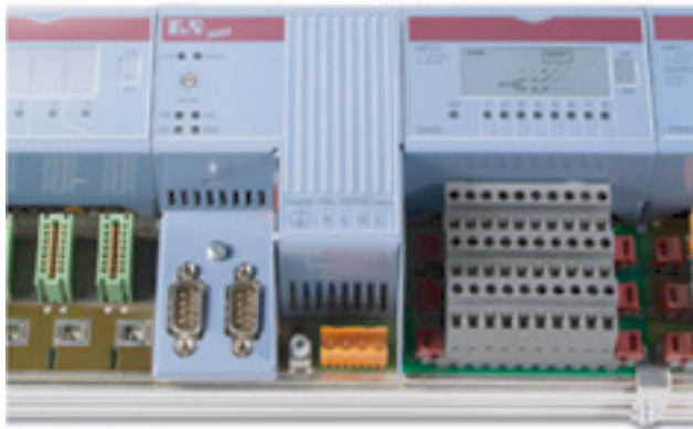
B&R 2003 and 2005 (Obsolete)