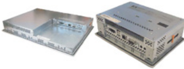
HMI PP320 (Obsolete)