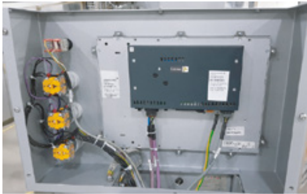
Panel PC 2100